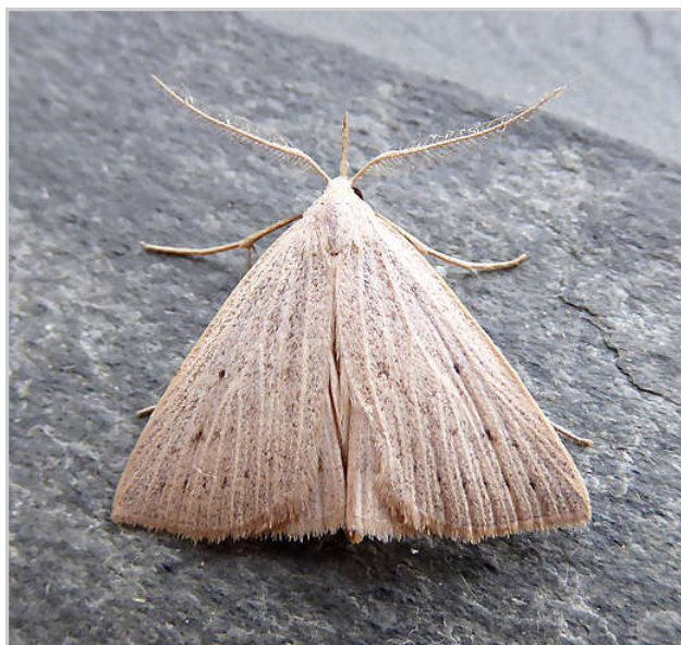
A Dotted Fan-foot moth found on Avon Meadows on 5 July 2019. This is the first time this species has been found in Worcestershire!

Counts have been good this year with most of our regular species being recorded. Emperor Dragonflies have been seen patrolling beside the boardwalk.