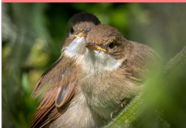
Young Common Whitethroats discovering the World of Avon Meadows in early June.