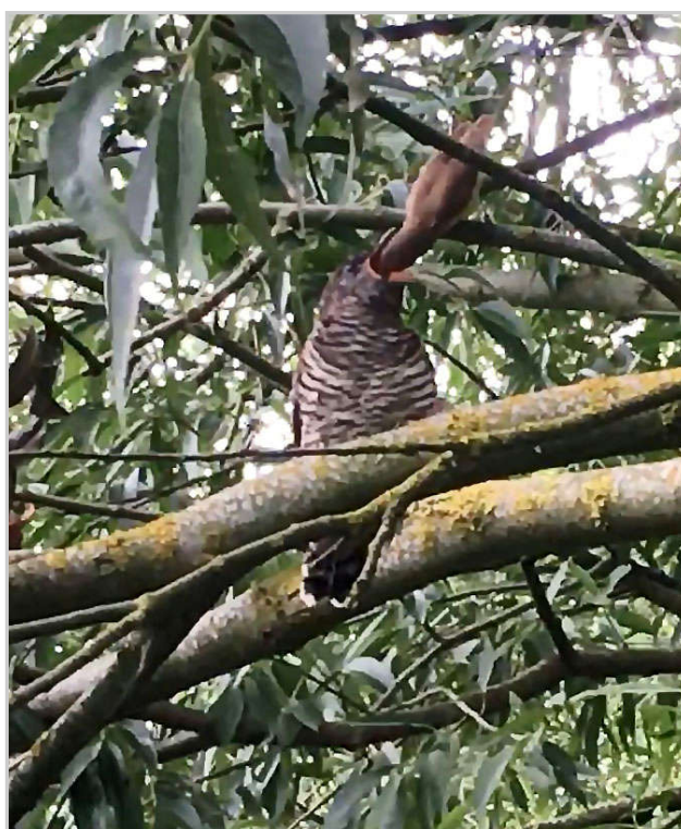
A young Cuckoo being fed by a Reed Warbler on Avon Meadows spotted by Alfie's sharp eyes! This is a still image taken from a video.

On Avon Meadows they are drawn in by the presence of Reed Warblers in whose nests they lay their eggs. The Reed Warblers build their nests in the middle of the reed beds and they are very hard to find. However the female Cuckoo perches in a nearby willow tree and just watches. She selects a target nest, usually with one or two eggs in it, and waits until the Reed Warblers have moved away for a short time, then she swoops down and lays just one egg which takes her about 8 seconds! Often she will remove just one Reed Warbler egg from the nest to balance the number.